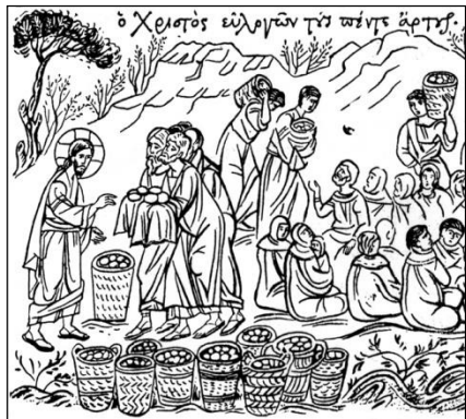
Feeding of the Five Thousand Miracle of Multiplication